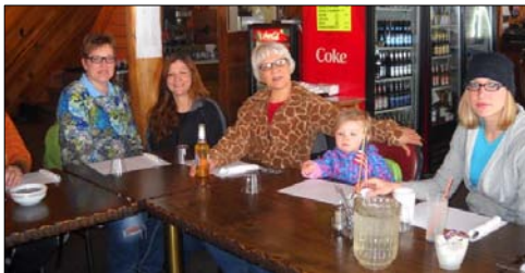
Some of The Lunch Ladies Young and not-quite-as-young ladies enjoy a monthly lunch get-together.