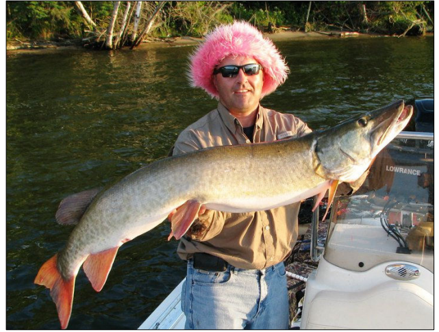
Even though all fishing gear is supplied to the Operation Muskie vets, this is not the standard issue hat. It's obviously his lucky one though!