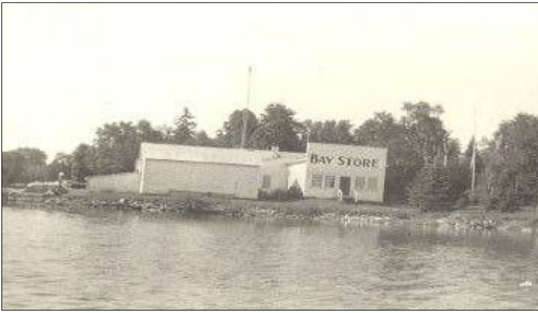
Exterior shots of the Bay Store. 1938