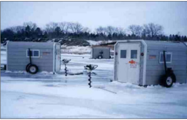
Zack Shack, to be featured in the Edge Riders' Rally raffle